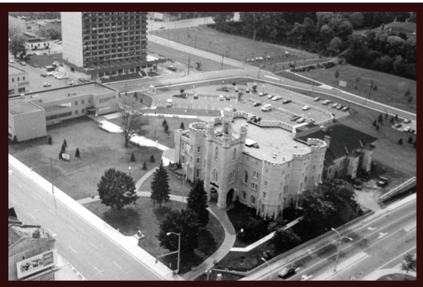
The Court House Block, c.1982

Throughout the years, this historic building has undergone extensive renovations while still keeping the integrity of its original appearance. The Court House and Gaol became a National Historic Site of Canada in 1955. Since the late 1970s, the former London District Courthouse and Gaol have accommodated the Middlesex County Council Chambers and the County Administrative Services and has stood as a visible link between Middlesex County and the City of London.