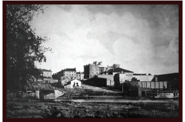
Court House and Gaol c.1878

Throughout the years, this historic building has undergone extensive renovations while still keeping the integrity of its original appearance. The Court House and Gaol became a National Historic Site of Canada in 1955. Since the late 1970s, the former London District Courthouse and Gaol have accommodated the Middlesex County Council Chambers and the County Administrative Services and has stood as a visible link between Middlesex County and the City of London.