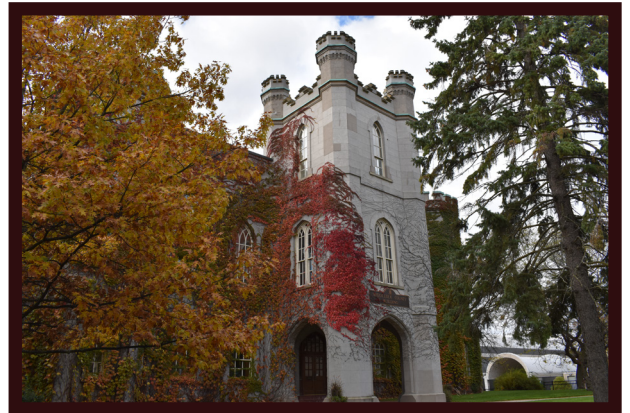
Court House and Gaol 2017